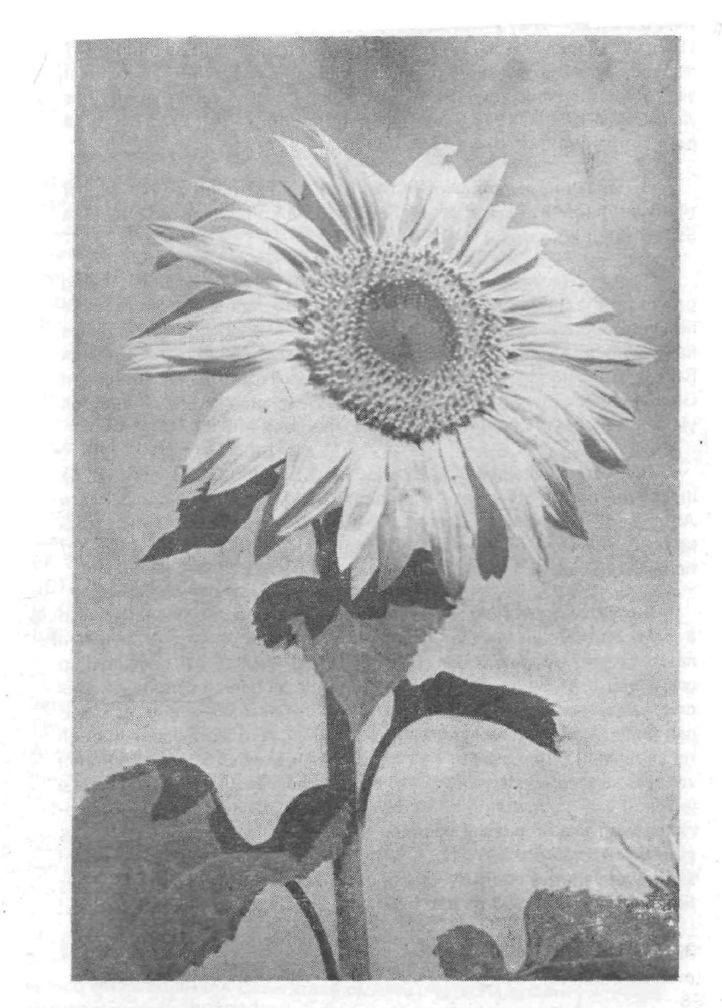
Fig. 1. Sunflower-a promising crop for drylands